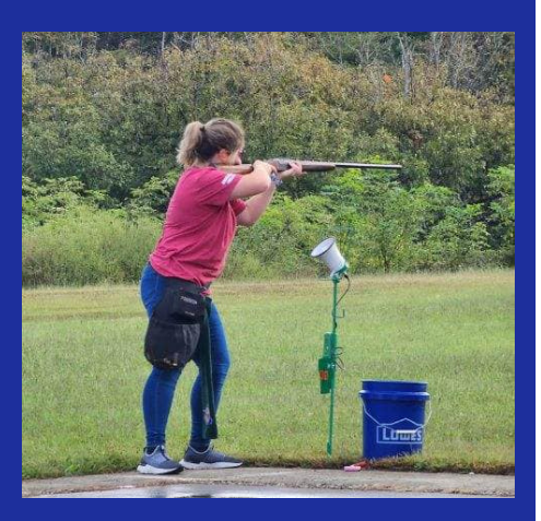
4-H Shooting Sports Competition