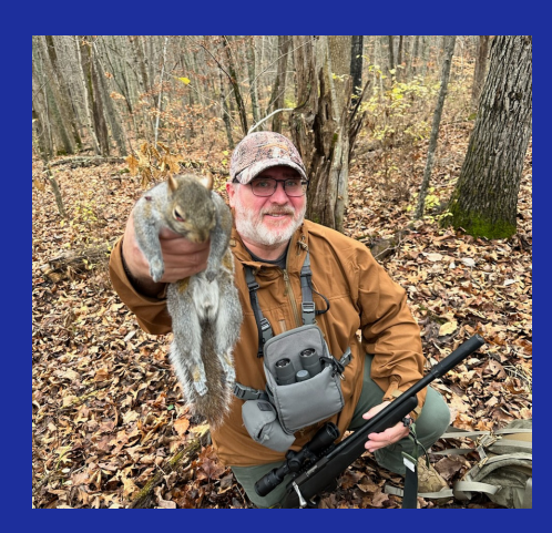
Small Game Field to Fork Participant