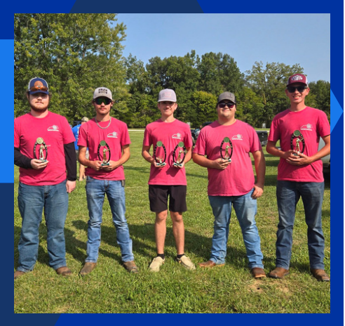
4-H Shooting Sports Competition