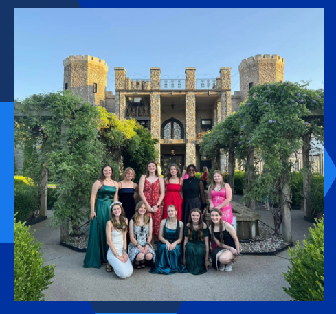
Teen Conference Area Night