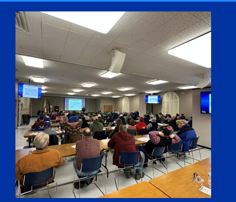
Winter School 2024

Clark County's Agriculture and Natural Resource programs provide education in agricultural production and environmental stewardship. ANR offers farm consultation and visits, soil testing, forage sampling, and much more to residents of Clark county. Educational programs will range from forage establishment, livestock stewardship, farm start, wildlife habitat improvement, and much more.