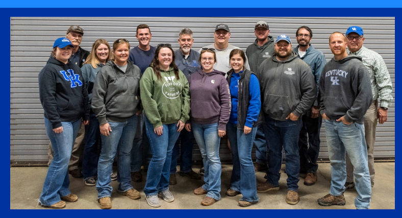
Agents from Counties Participating in the 2024 Hay Contest