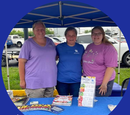
University of Kentucky Farmer's Market Opening Day

The Clark County Extension Office Horticulture program provides educational training and technical assistance to our community. Our technical services include soil testing, disease diagnosis, and plant, weed, and insect identification. Cooperative Extension is the major provider of research-based information for consumers and horticulture businesses.