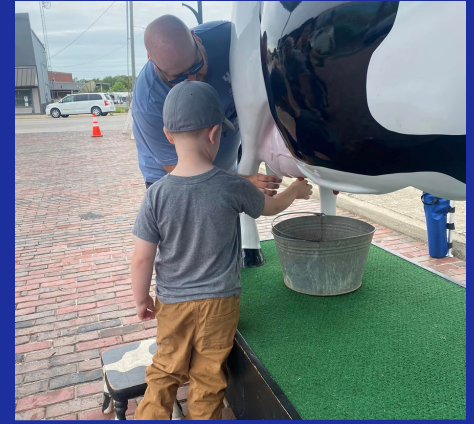
Agventures Dairy Demonstration

Winter School is the opportunity for anyone in Clark County to learn about interesting agricultural topics such as fencing laws, beef minerals, local beef diseases, water management for farm structures, agricultural drones, heavy-use feeding pads, pest management, and perennial vegetables. Winter school consisted of 3 nights hosting over 240 participants total.