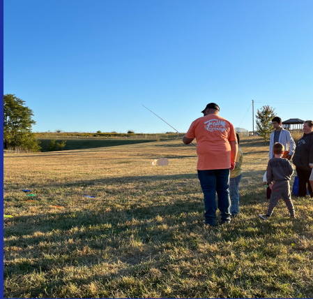
Teaching Casting at Extension Fall Fest