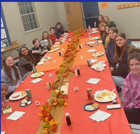
4-H Teen Council Thanksgiving

Each month of the school year we visit 32 3rd and 4th grade classrooms to do an educational 4-H lesson on our core content areas.