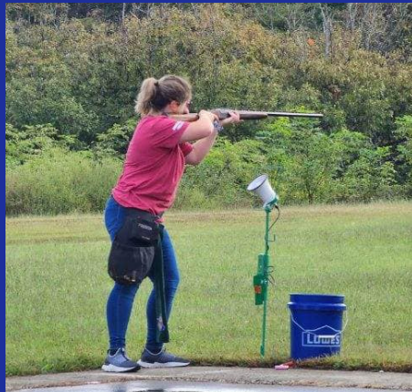
4-H Shooting Sports Competition