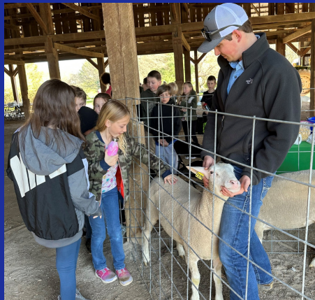
4-H Agriculture Days