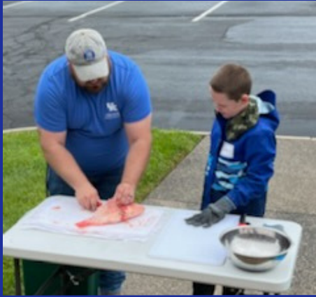
Youth Hook & Cook Filet Demo

Clark County's Agriculture and Natural Resource programs provide education in agricultural production and environmental stewardship. ANR offers farm consultation and visits, soil testing, forage sampling, and much more to residents of Clark county. Educational programs will range for forage establishment, livestock stewardship, farm start, wildlife habitat improvement, and much more.