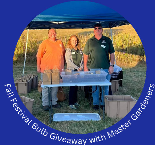
Fall Festival Bulb Giveaway with Master Gardeners

Extension Horticulture supported citizens of the community with different horticultural needs through 27 plant disease diagnoses, 17 plant identifications, over 50 soil samples, and more than 35 site visits.