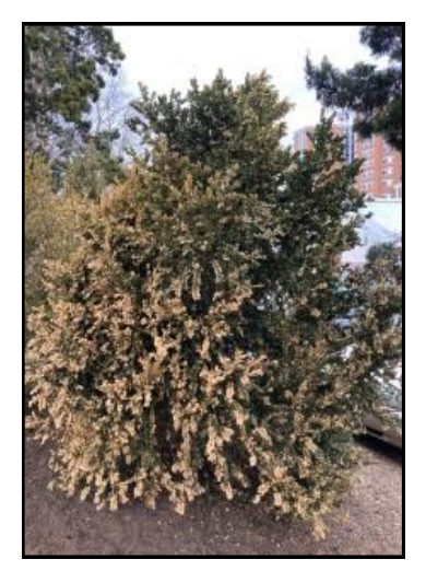
Figure 2: Severe leaf burn on windward side of boxwood

drying. On broadleaf evergreens (boxwood, cherrylaurel, holly, magnolia, rhododendron, etc.) symptoms typically include marginal leaf scorch, irregular spotting, complete browning of the leaves, and occasionally extensive leaf drop. Conifer (arborvitae, Leyland cypress, Cryptomeria, juniper, etc.) symptoms include pale, bronze or brown needles or needle tips, particularly on the exterior foliage and branch tips. Symptoms are often more noticeable on the wind-exposed side of affected plants.